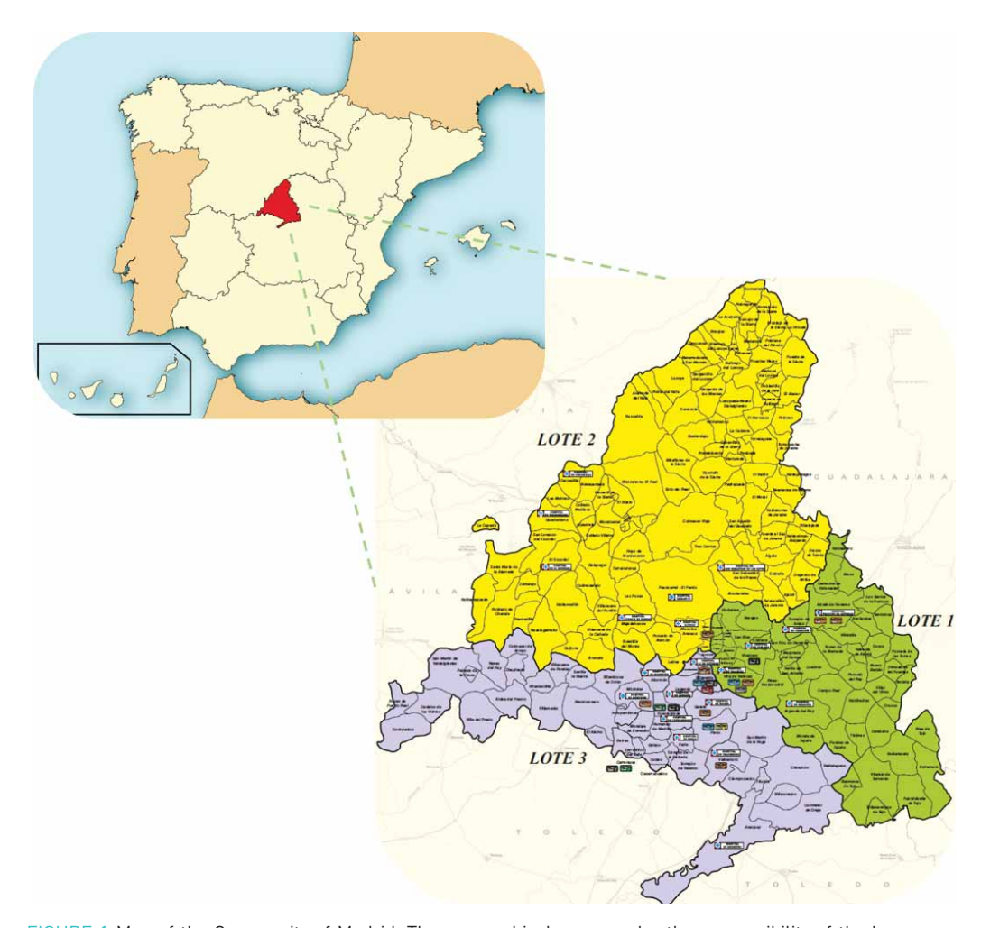
FIGURE 1 Map of the Community of Madrid. The geographical areas under the responsibility of the home care provider Oximesa Nippon Gases are the yellow zone marked as Lote 2 and the purple zone marked as Lote 3. It can be seen that Oximesa Nippon Gases is responsible for the respiratory homecare of \sim 70% of the population of Madrid.

A telephone-based survey was conducted in patients undergoing portable oxygen therapy that were registered in the database of the local homecare provider Oximesa Nippon Gases (Madrid). This company is the home respiratory care company responsible for the provision of domiciliary respiratory therapies in a geographical area of the Community of Madrid that gives coverage to a population of 4051862 inhabitants (figure 1). In this area, all patients receiving domiciliary oxygen therapy, noninvasive