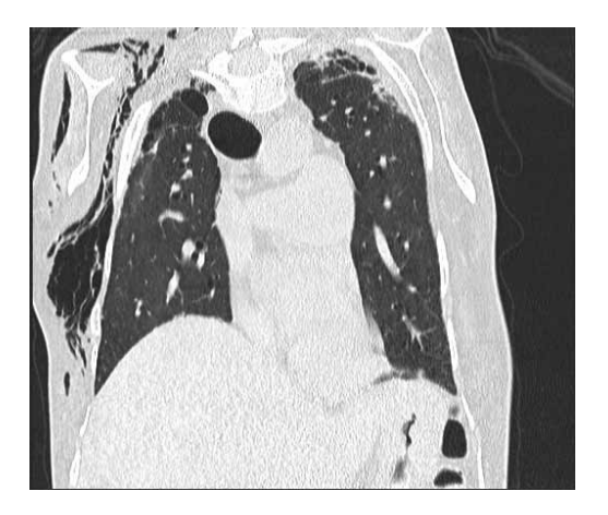
FIGURE 2 Chest computed tomography of patient 5, presenting with right arm swelling due to small apical pneumothorax and subcutaneous emphysema, treated conservatively with supplemental oxygen therapy.

In this case series (table 1) we describe five patients with confirmed collagen VI-RD who developed pneumothoraces: three were children with isolated events related to medical procedures and two were young adults who developed recurrent pneumothoraces without traditional inciting barotrauma. In each case, the clinicians attributed the pneumothorax to an associated stressor, including vaginal delivery,