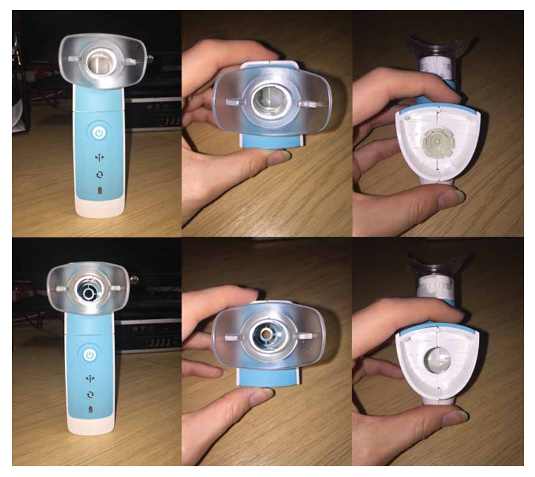
FIGURE 2 Top (left to right): Aerosure Medic active device, and device aerosol head anterior and inferior views. Bottom (left to right): Aerosure Medic sham device, and device aerosol head anterior and inferior views. Note mechanism removed from sham device.