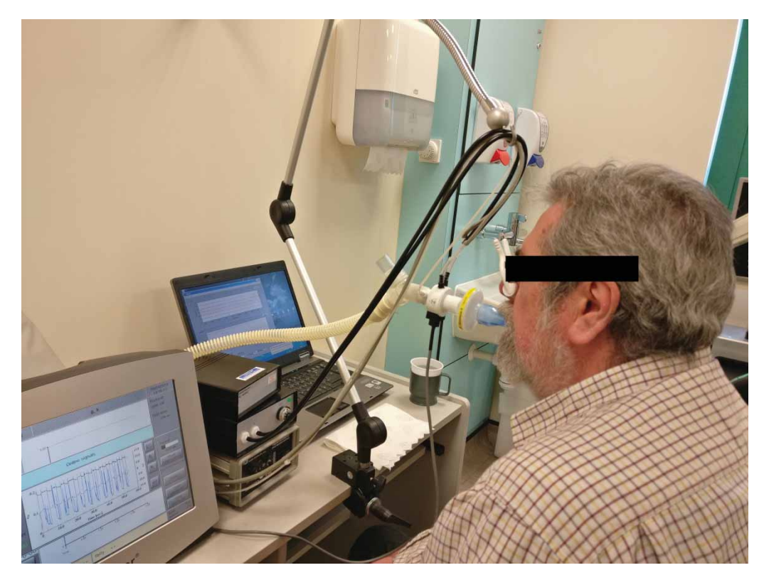
FIGURE 4 Patient performing a multiple breath washout measurement.

Participants of the randomised control trial will be invited to participate in focus groups after the completion of the trial. This will provide insight into the experiences of using a device for the management of symptoms, which is an area of little research. The aim of the focus groups will be to provide an understanding of the use of the device for the management of COPD. This may also give insight into the compliance of the device during and after the trial. Both the intervention and the sham group will be invited to participate, as from the completion of the study all groups will be given an active device to retain. Those who express interest at the time of consent will be invited to participate. We will aim to conduct a minimum of two focus groups with around 5–10 participants per group. The topic of discussion has been developed with an experienced qualitative researcher and members of the Centre of