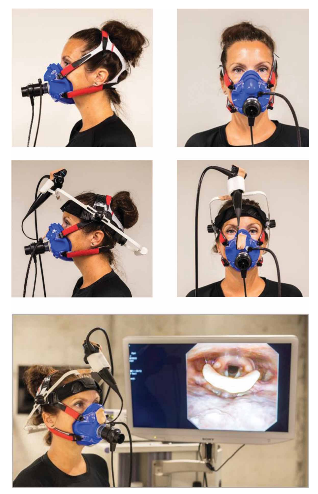
FIGURE 1 Illustration of the set-up for cardiopulmonary exercise test (CPET) with and without continuous video laryngoscopy. The upper left and right images demonstrate the facemask used for ordinary CPET. The middle left and right images demonstrate the modified facemask with a flexible transnasal laryngoscope positioned through a tight-fit opening. A custom-made headgear secures the body of the laryngoscope. The attached transnasal flexible laryngoscope enables video recording of the laryngeal inlet during the maximal exercise treadmill test (bottom image).